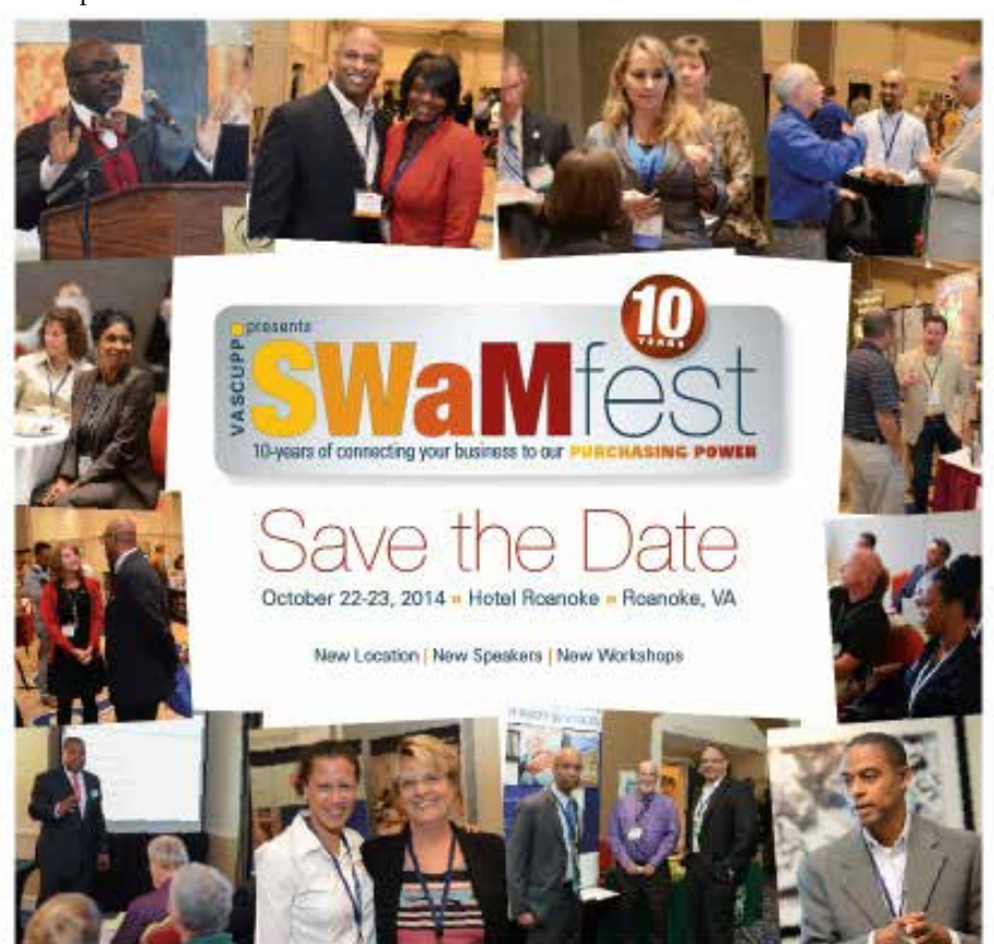
@SWAPHER | Week, SWAPHER, Cold. | Indig SWaPHER, Cold.

Thanks again to all of the sponsors and participants for making this year's event one of the best yet. SWaMfest 10, marking the 10 anniversary of SWaMfest, will be held in Roanoke Virginia, October 22nd-23rd, 2014. For more information, go to www.swamfest.com or follow us on Twitter at @swamfest.